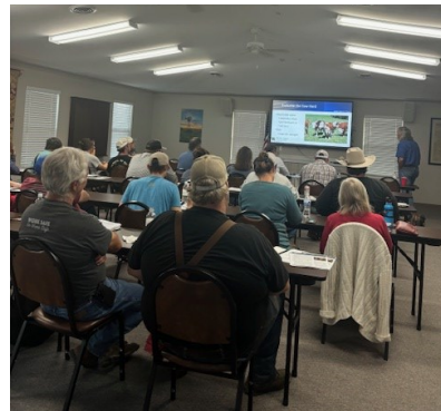
Participants attending a beef meeting.

As we strive to increase food productivity and efficiency, one of the many services offered by the Woodford County Extension Service is one-on-one education with producers on various issues they may be facing on their farm. Everything from pasture evaluation and renovation recommendations, forage testing, soil diagnostic services, pest identification, and marketing or financial opportunities may be covered. Individualized farm visits allow us to meet the goals of the producer, and bring various ideas from a wealth of information provided by university specialists.