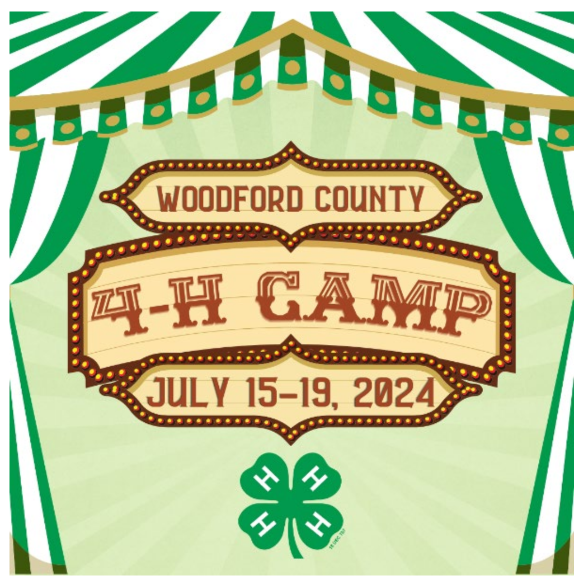
4-H Camp Applications Now Available! Use the link HERE to grab your application - but don't wait too long! Spots will fill up quick!